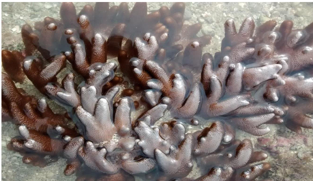
Figure-2 soft coral colony, sinularia polydactyla recolonized on the Chandri reef