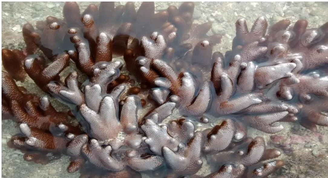
Figure-2 soft coral colony, sinularia polydactyla recolonized on the Chandri reef